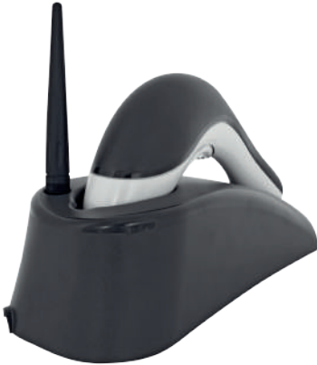
Delfino is composed of the receiver base and the hand piece.

Delfino is the evolution of the traditional otoscope: the small and ergonomic hand piece allows the operator to see, capture and store top-quality images of the ear canal. All this with the maximum patient and operator comfort, thanks to the wireless feature.