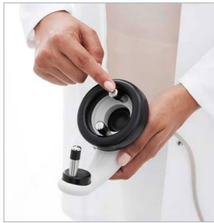
Place a drop of electrode gel on the integrated electrodes