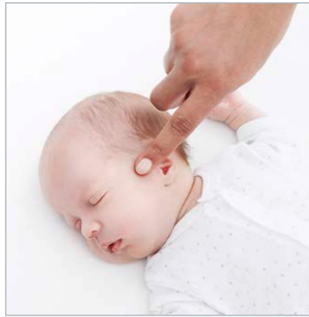
Apply electrode gel at the three electrode sites on the baby's head