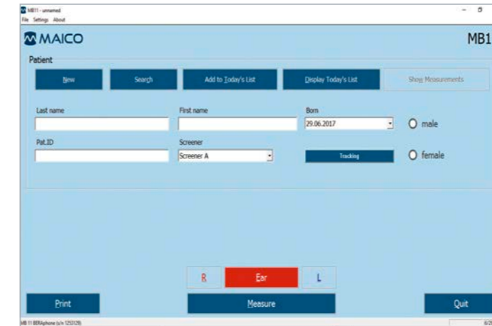
Start Screen – Simple user interface enhances ease of training