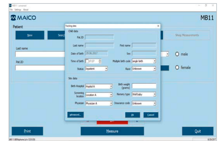
Tracking – HiTrack and Oz compatible export functions available