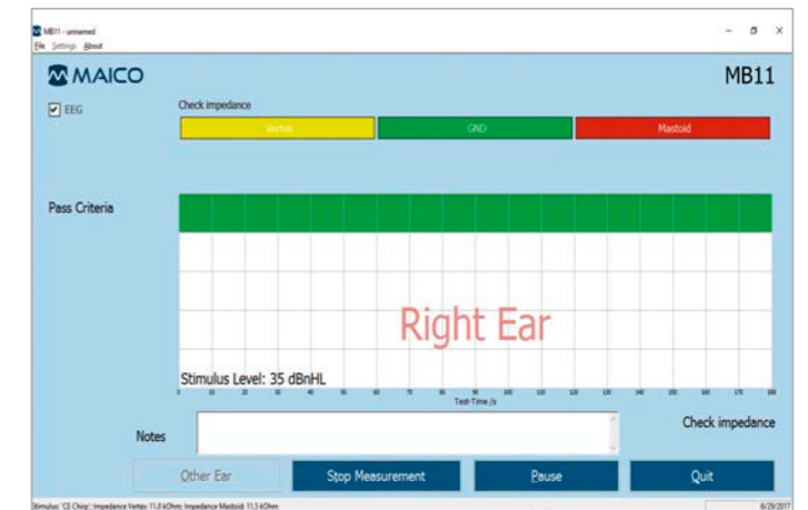
Traffic Light – “Traffic light” display for electrode contact and test quality provides easy to understand feedback to screeners.