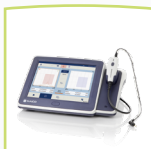
touchTymp with printer