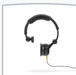
DD45 C (Tympometry)