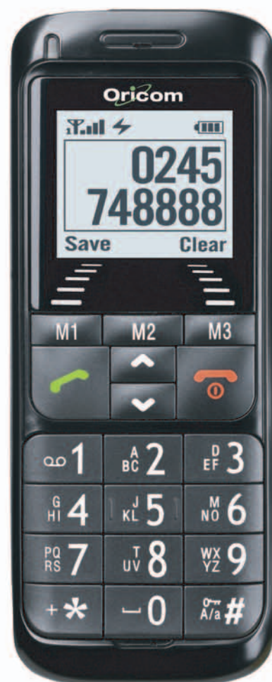
IMAGE SHOWS ACTUAL SIZE

In an emergency get help quickly - simply slide the help switch to automatically dial a sequence of up to 5 numbers.