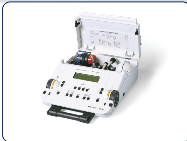
MA 53 with accessories in integral carrying case

The MA 53 offers high tone audiometry with AC for advanced diagnostics.